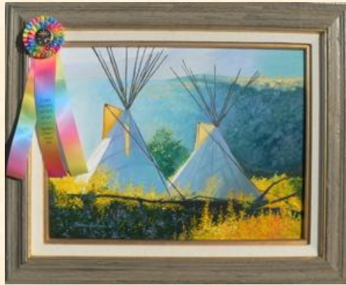
Mystic Morning 18”x 24” Original Oil Painting on Linen Canvas