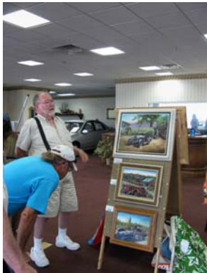
A fun time, great days and nice people