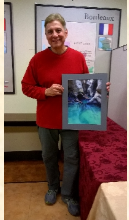
Winner – Photography Ernesto Chavez