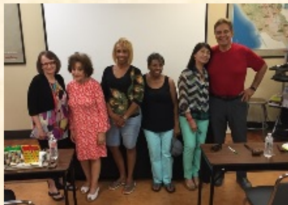
CCAG Board at July Meeting